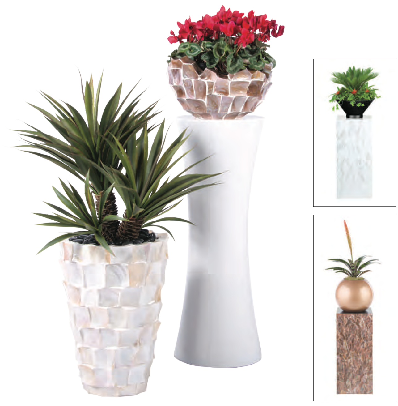
Natural Shell Pedestals

Hand made from natural polished shells. Each shell is meticulously fitted onto a synthetic base material, creating stunning bowls and cone planters. Natural Shells are available in Polished Natural White and Polished Natural Brown, both of which have an iridescent sheen and brighten any interior environment exponentially.