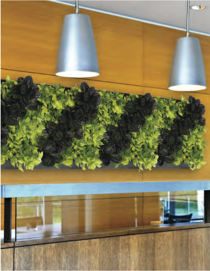
Four PP-3232's arranged horizontally