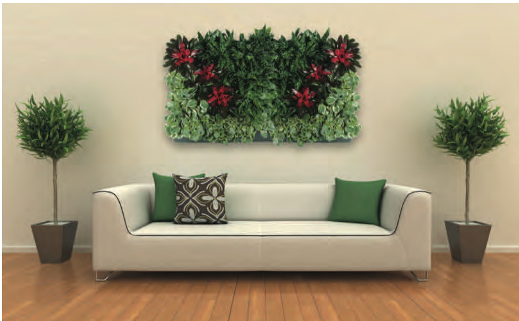
Two PP-3232's arranged horizontally